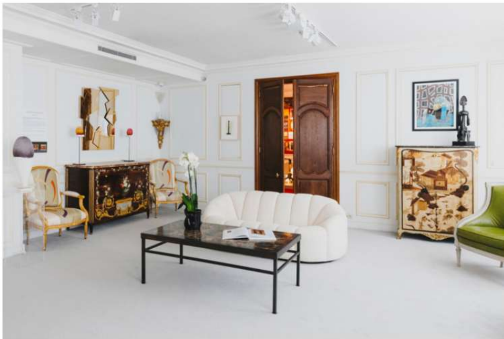
📷 Inside Galerie Kraemer.

The 18 th century furniture and antiques specialist now also focuses on Modern and Contemporary art and design and demonstrates how “18 th century masterpieces work with outstanding Modern and Contemporary works”.